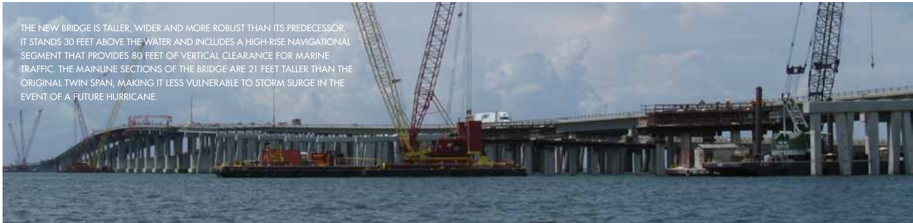
THE NEW BRIDGE IS TALLER, WIDER AND MORE ROBUST THAN ITS PREDECESSOR. IT STANDS 30 FEET ABOVE THE WATER AND INCLUDES A HIGH-RISE NAVIGATIONAL SEGMENT THAT PROVIDES 80 FEET OF VERTICAL CLEARANCE FOR MARINE TRAFFIC. THE MAINLINE SECTIONS OF THE BRIDGE ARE 21 FEET TALLER THAN THE ORIGINAL TWIN SPAN, MAKING IT LESS VULNERABLE TO STORM SURGE IN THE EVENT OF A FUTURE HURRICANE.

Geaux Wider NOLA is a multi-year construction initiative to widen 1.2 miles of I-10 from six to ten lanes between Clearview Parkway and Veterans Memorial Boulevard. The project will increase capacity, improve safety and enhance mobility on this heavily traveled segment of I-10 in Jefferson Parish. In October 2011, DOTD celebrated the start of construction on this $42.4 million project, which is expected to be complete in June 2013.