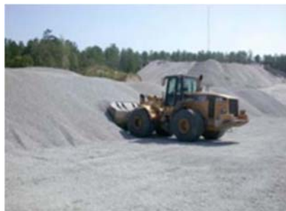
Step 1: Enter stockpile with bucket at minimum 1 ft. above ground level