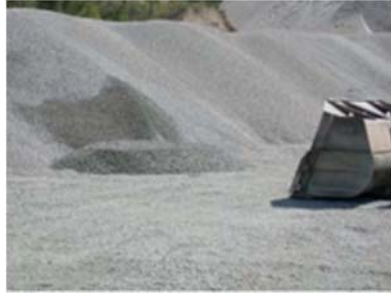
Step 3: Sampling Pad