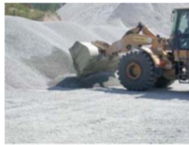
Step 2: Loader reaches across pile and back drags pile to form sampling pad