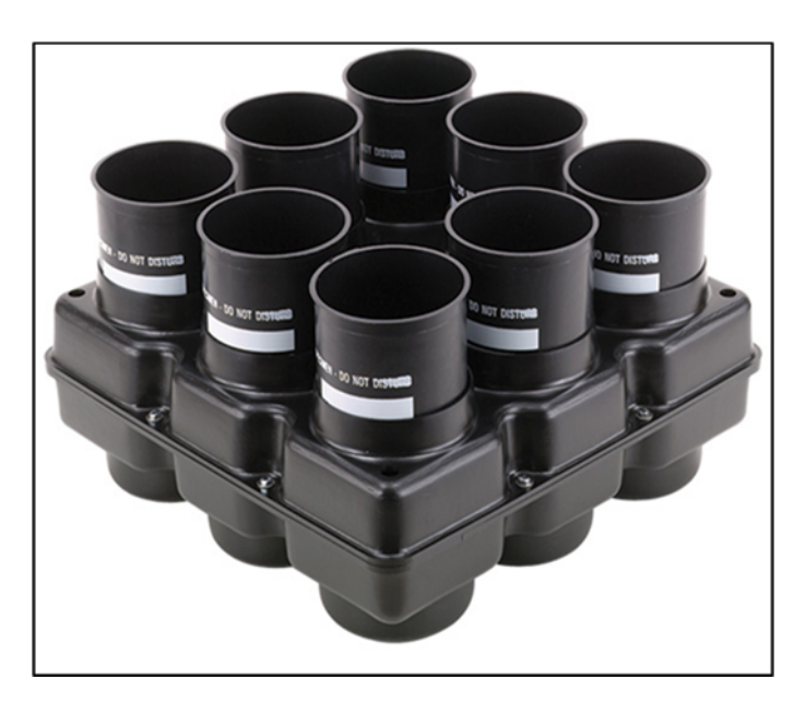
Figure A-2 Typical Concrete Cylinder Transport Box