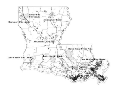
Figure 1. Statewide Flood Control Program Nine Urban Areas Funding Group

a. During this six month period, the Evaluation Committee will review and evaluate all completed applications in order to make recommendations to the Joint Legislative Committee on Transportation, Highways, and Public Works for funding. Applications will be divided into urban and rural categories. Applications for projects in the nine major urban areas comprise the urban category, as shown in the Figure 1, and compete against all other urban projects for funding. All other applications will be grouped by funding district as shown in Figure 2. Rural projects are subdivided into two categories, rural-developed and ruralundeveloped. Rural-undeveloped projects compete only against other rural-undeveloped projects in the same funding district and likewise for rural-developed projects. Proposed projects will be evaluated and ranked based on criteria established by the Evaluation Committee.