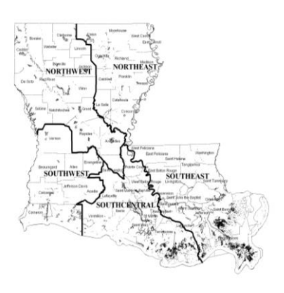
Figure 2. Statewide Flood Control Program Five Funding Districts for Rural Projects

b. Projects recommended to the Joint Legislative Committee will include a mix of those occurring in ruralundeveloped and rural-developed areas within each funding district as well as those for urban areas of the state. The method for allocating funding percentages within each district and the method for allocating total program funds to the various districts are presented in Subchapter D, Evaluation of Proposed Projects and Distribution of Funds.