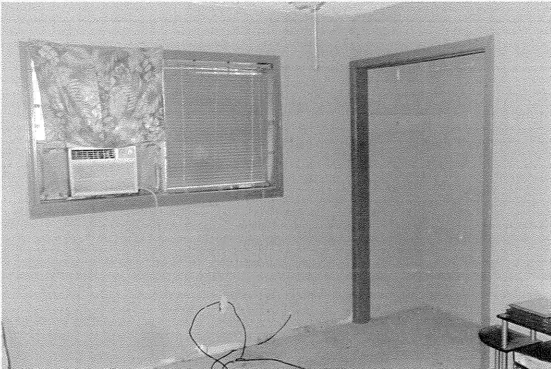
Photo 4 View of typical bedroom.