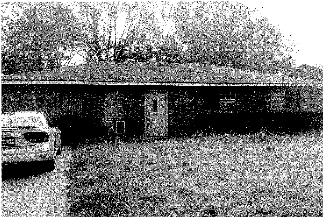
Photo 1 View of subject residence.