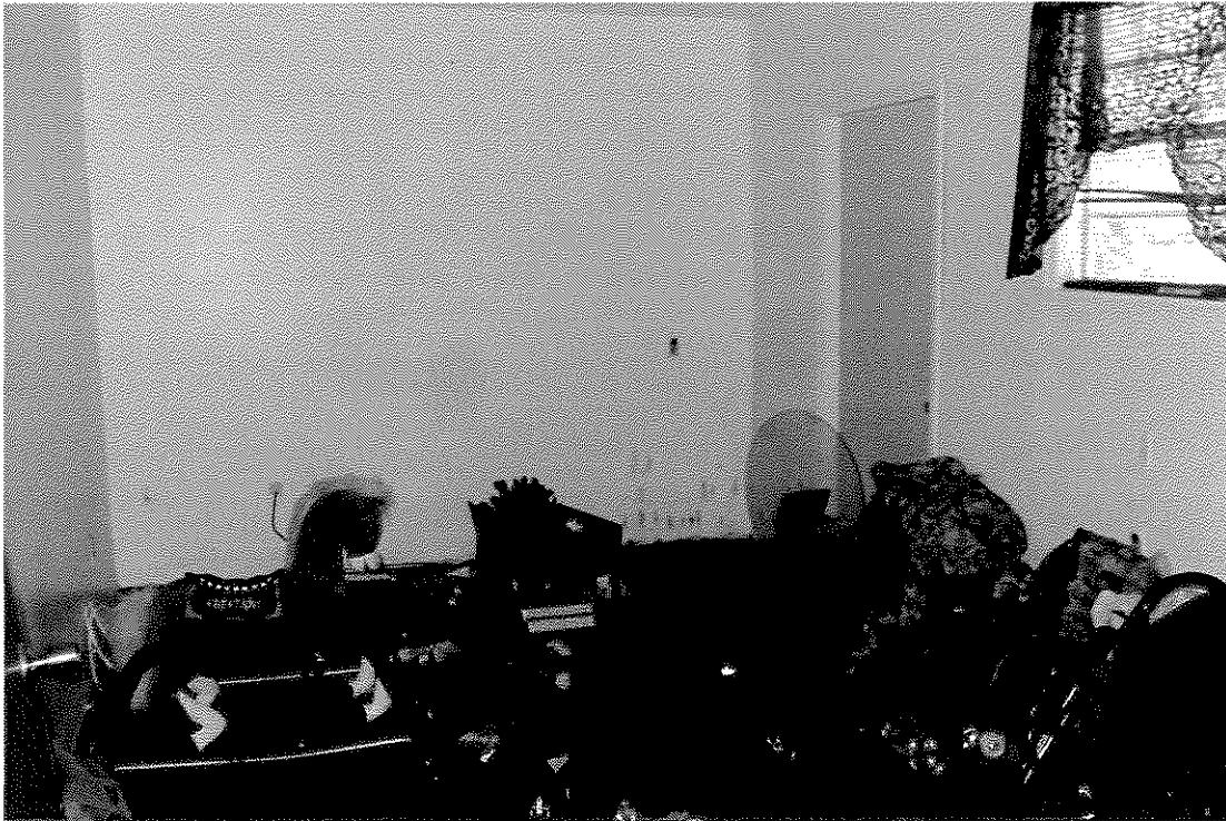
Photo 5 View of enclosed garage.