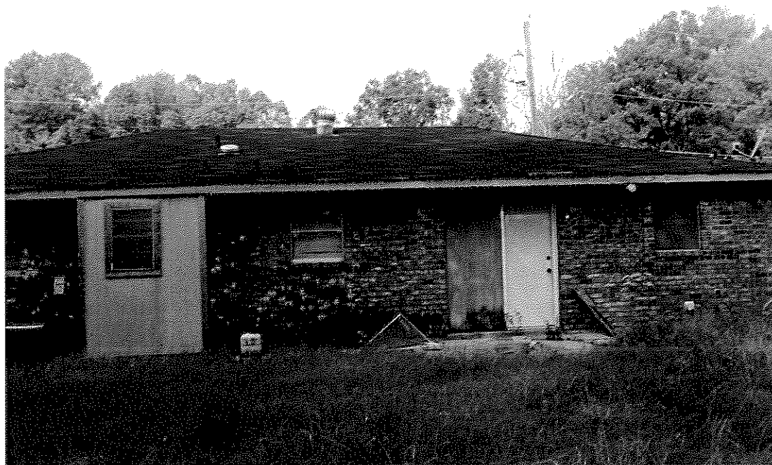
Photo 2 View of rear of structure.