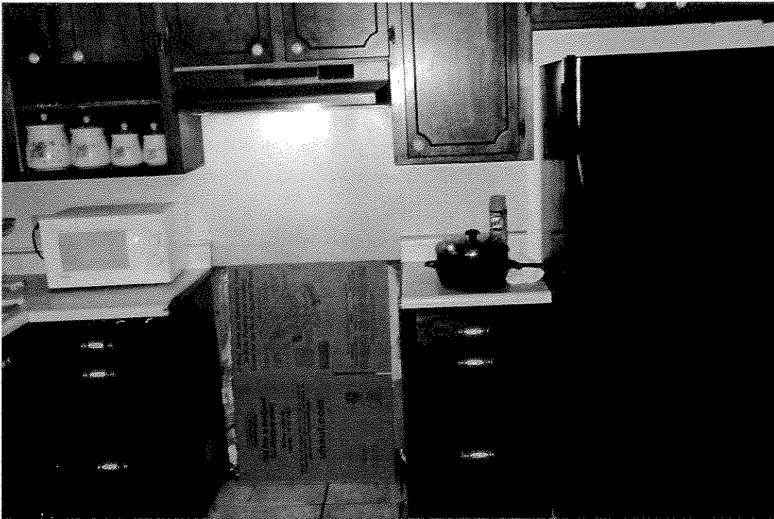
Photo 3 View of kitchen interior finishes.