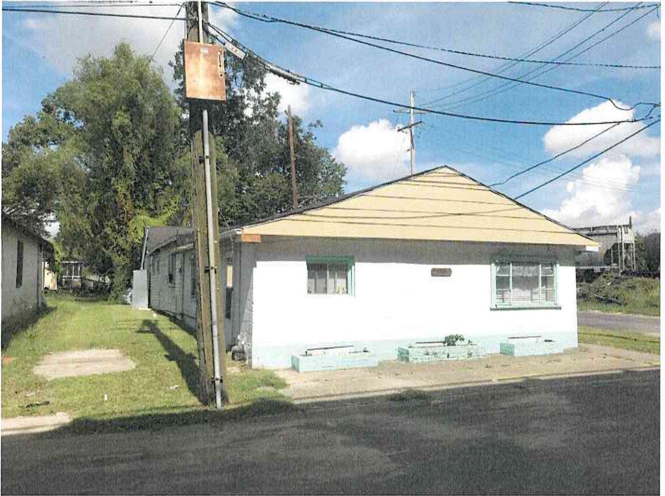
House to be demolished.