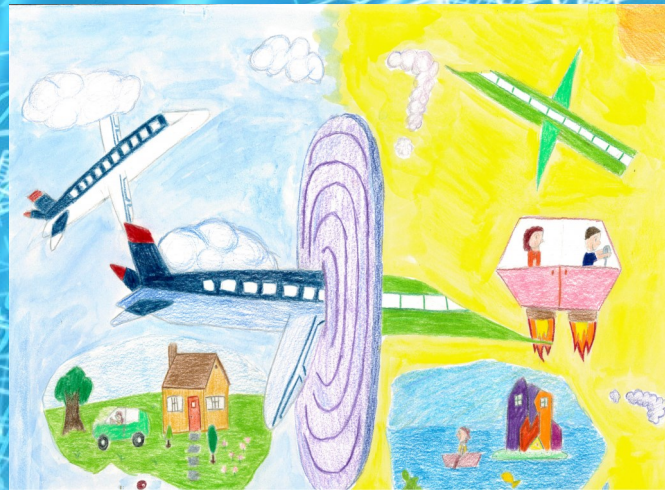
2018 2nd Place—Ages 10-11 Emily Chen—Buchanan Elem—Baton Rouge, La