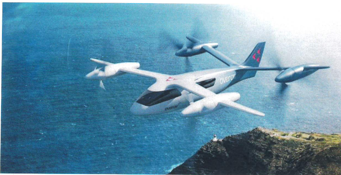
Rendering of the Butterfly eVTOL

Today, Overair announced two additional memoranda of understanding – this time with organizations in Texas, to help bring commercial EV operations to the northern region of the Lone Star State.